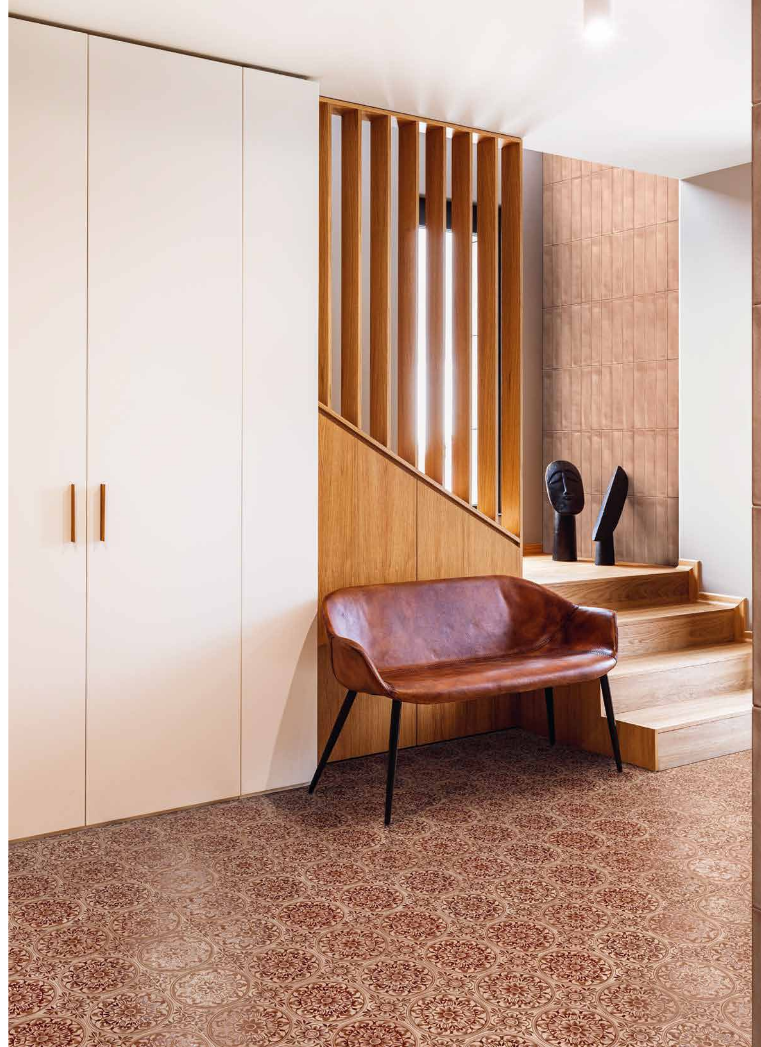
Mira Cotto 2"x12" Mira Decoro Pizzo Cotto 8"x8"