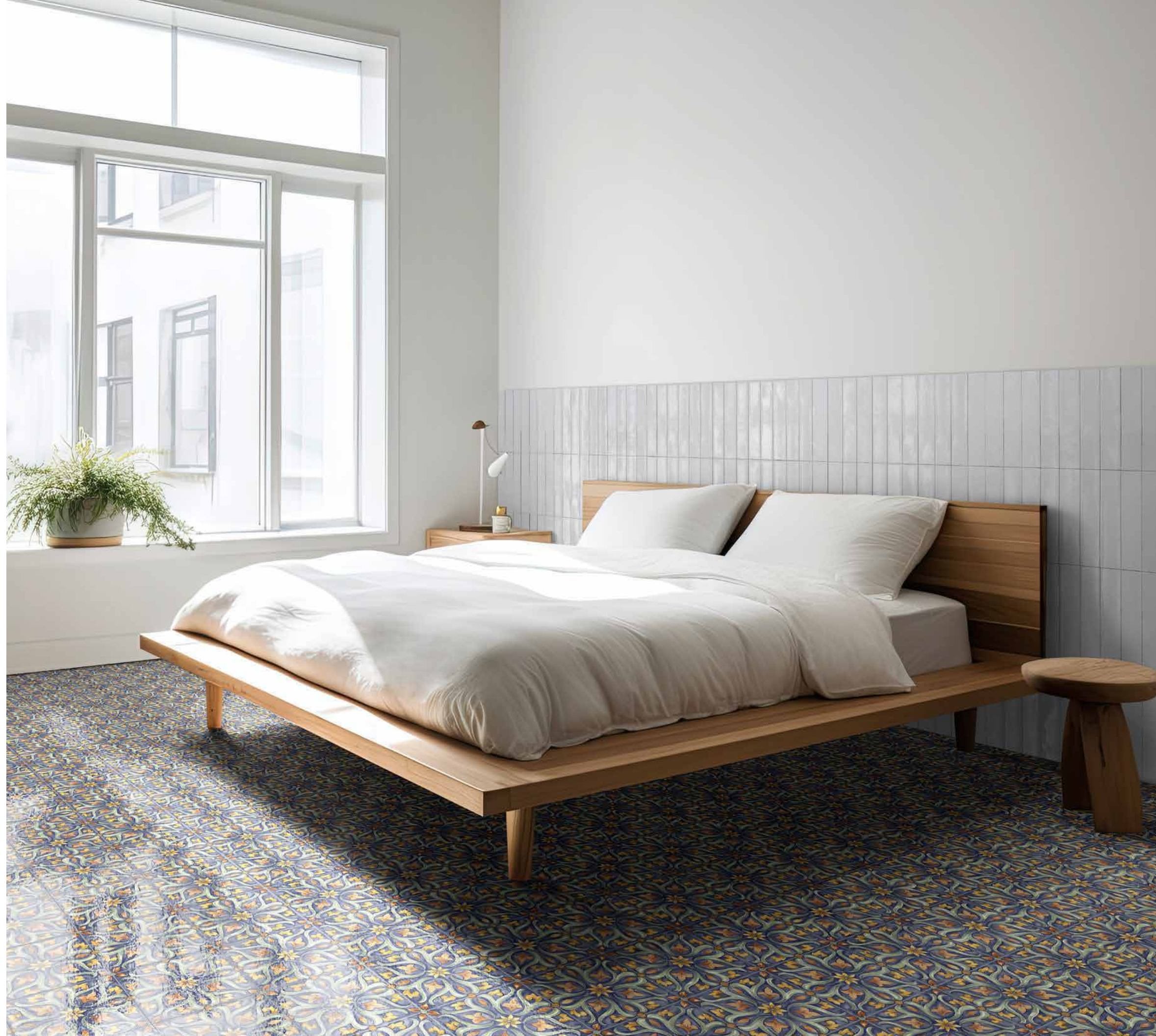
Mira Bianco Glossy 2"x12" Mira Decoro Maiolica Tappeto 4 Glossy 8"x8"