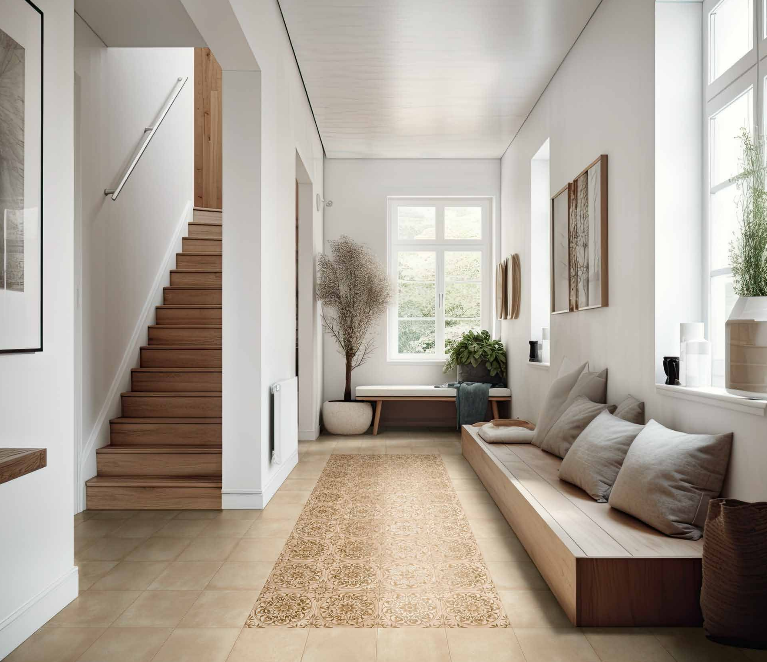
Mira Biscotto 8"x8" Mira Decoro Pizzo Biscotto 8"x8"