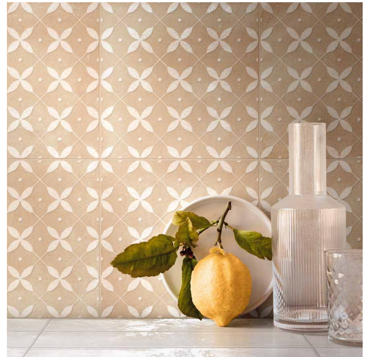
Mira Bianco Glossy 2"x12" Mira Decoro Zucchero Biscotto 8"x8"