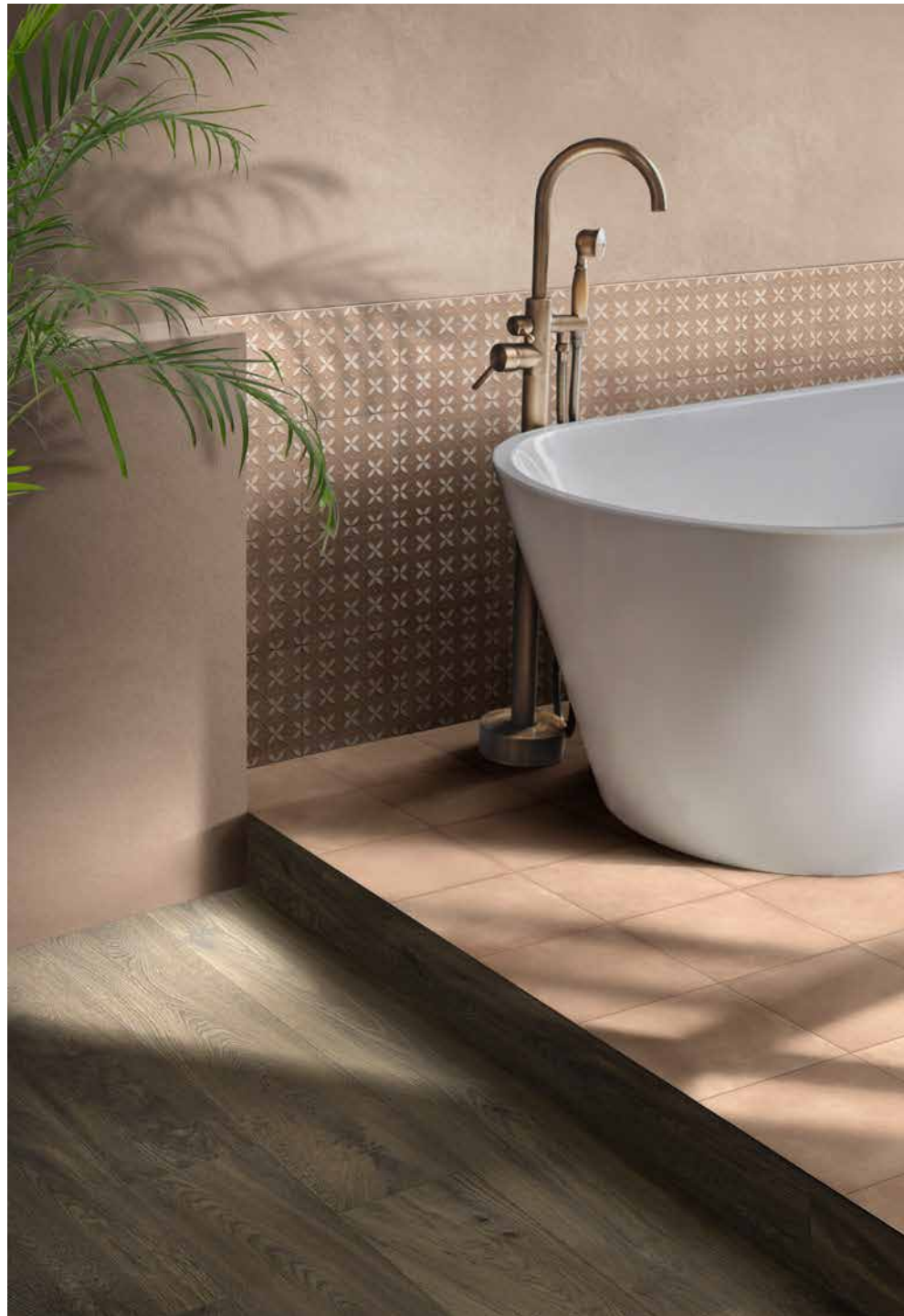
Mira Cotto 8"x8" Mira Decoro Zucchero Cotto 8"x8"