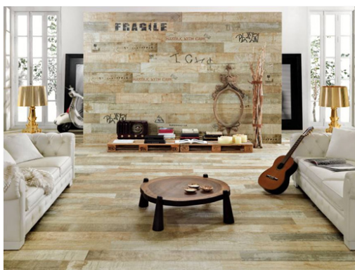
Figure 1. Product covered in the EPD

The annexes include the results for the formats included in the EPD with minimum and maximum environmental impact.